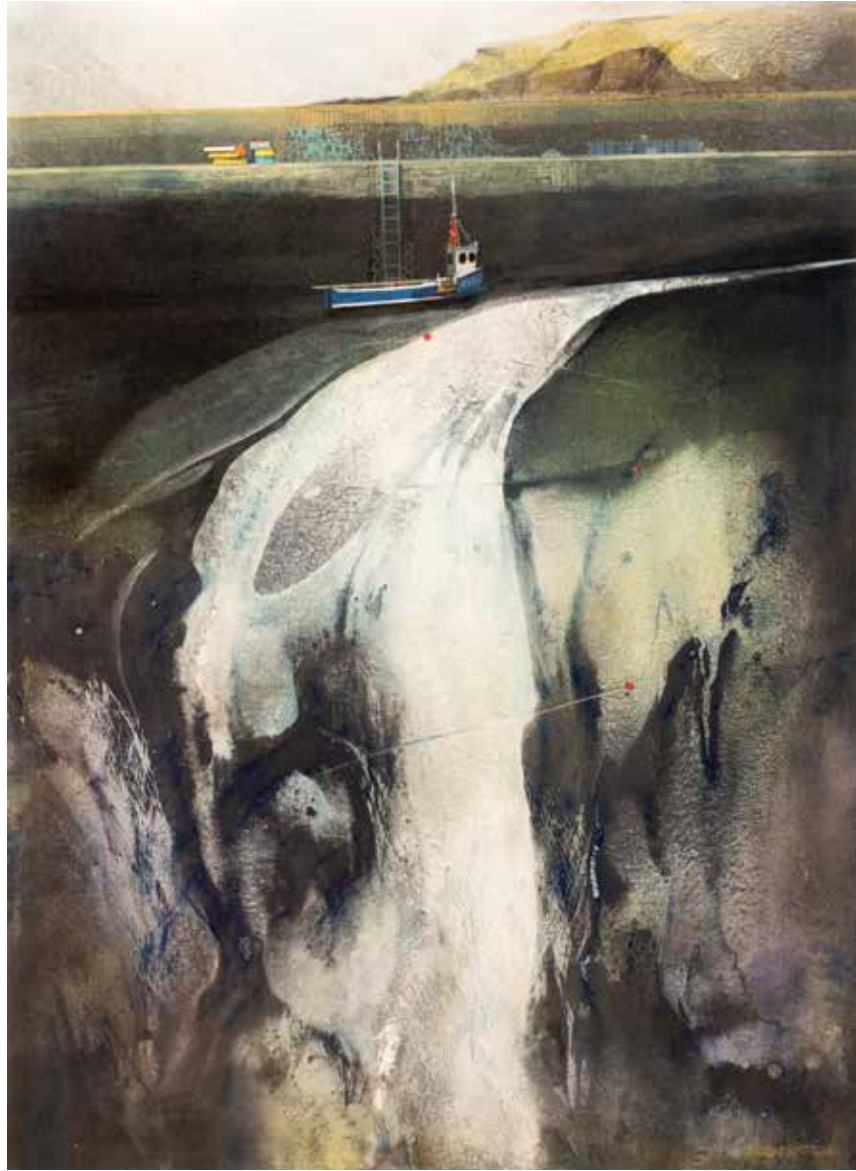
Blue Trawler, Low Tide mixed media 110 x 80 cm