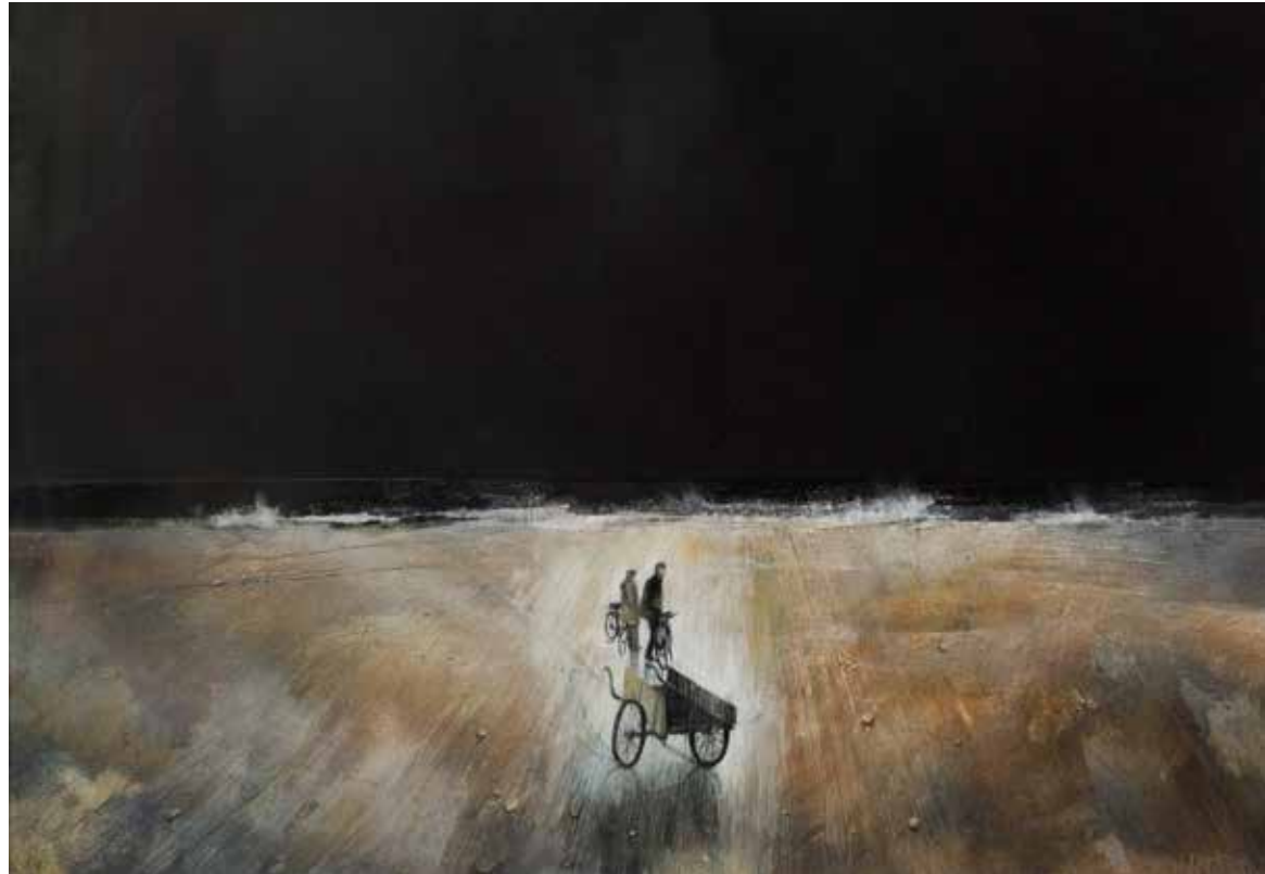
Evening Beach acrylic and gesso on paper 100 x 130 cm