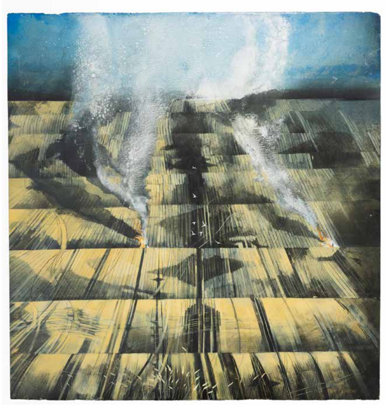
Fire Burnt the Land acrylic and gesso on paper 116 x 112 cm