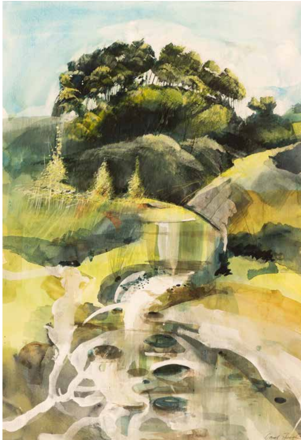
Falling Water watercolour 105 × 81 cm