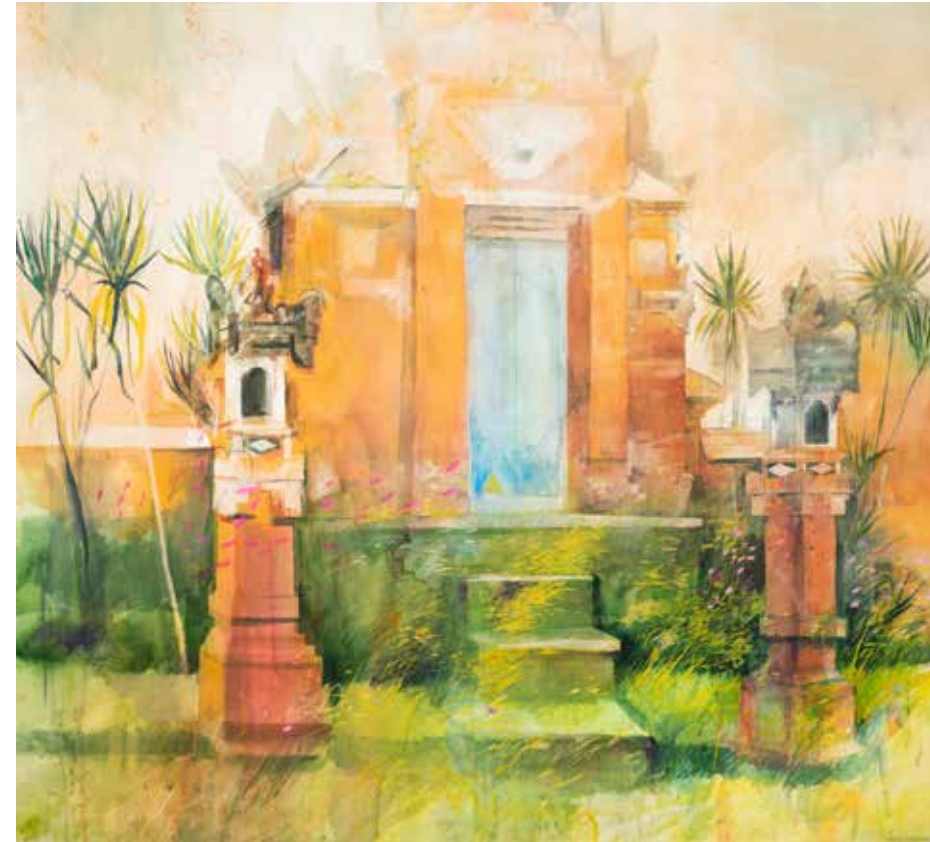
Temple Bali watercolour 105 x 112 cm

First published in 2023 by Campden Gallery Ltd, High Street, Chipping Campden, Gloucestershire GL55 6AG www.campdengallery.co.uk