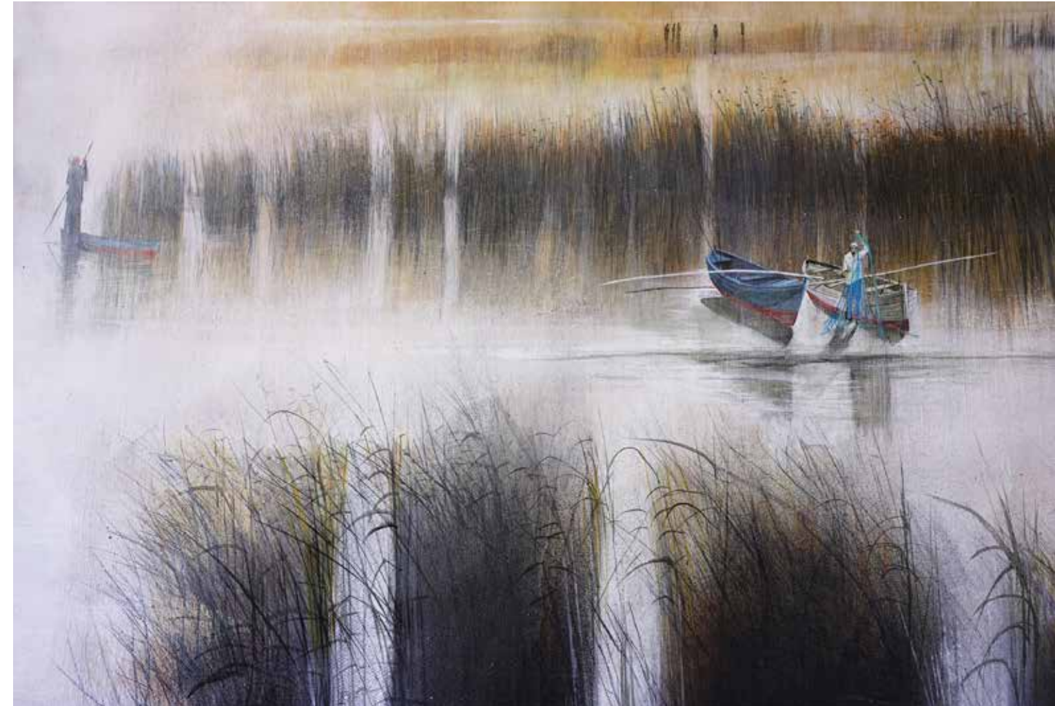
Sicilian Fishermen watercolour 93 × 122 cm