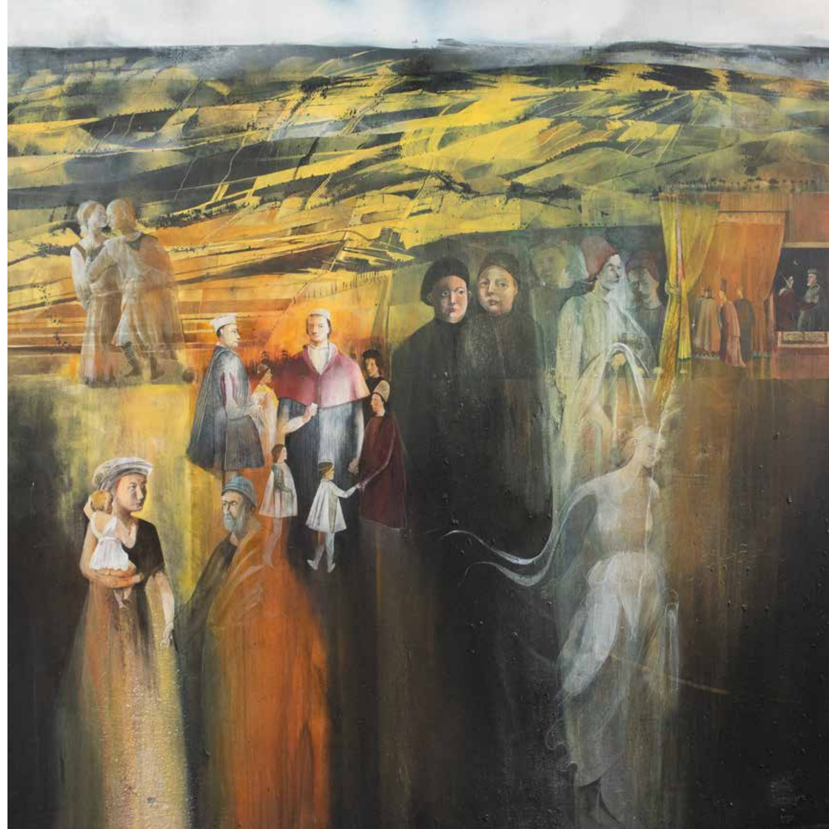
Italian Dreams acrylic and gesso on canvas 184 x 184 cm