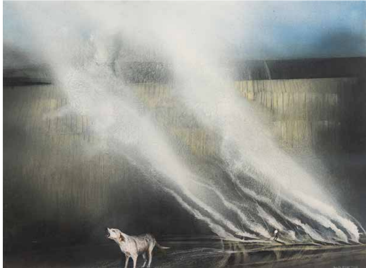
Howling Dog watercolour 69 x 89 cm