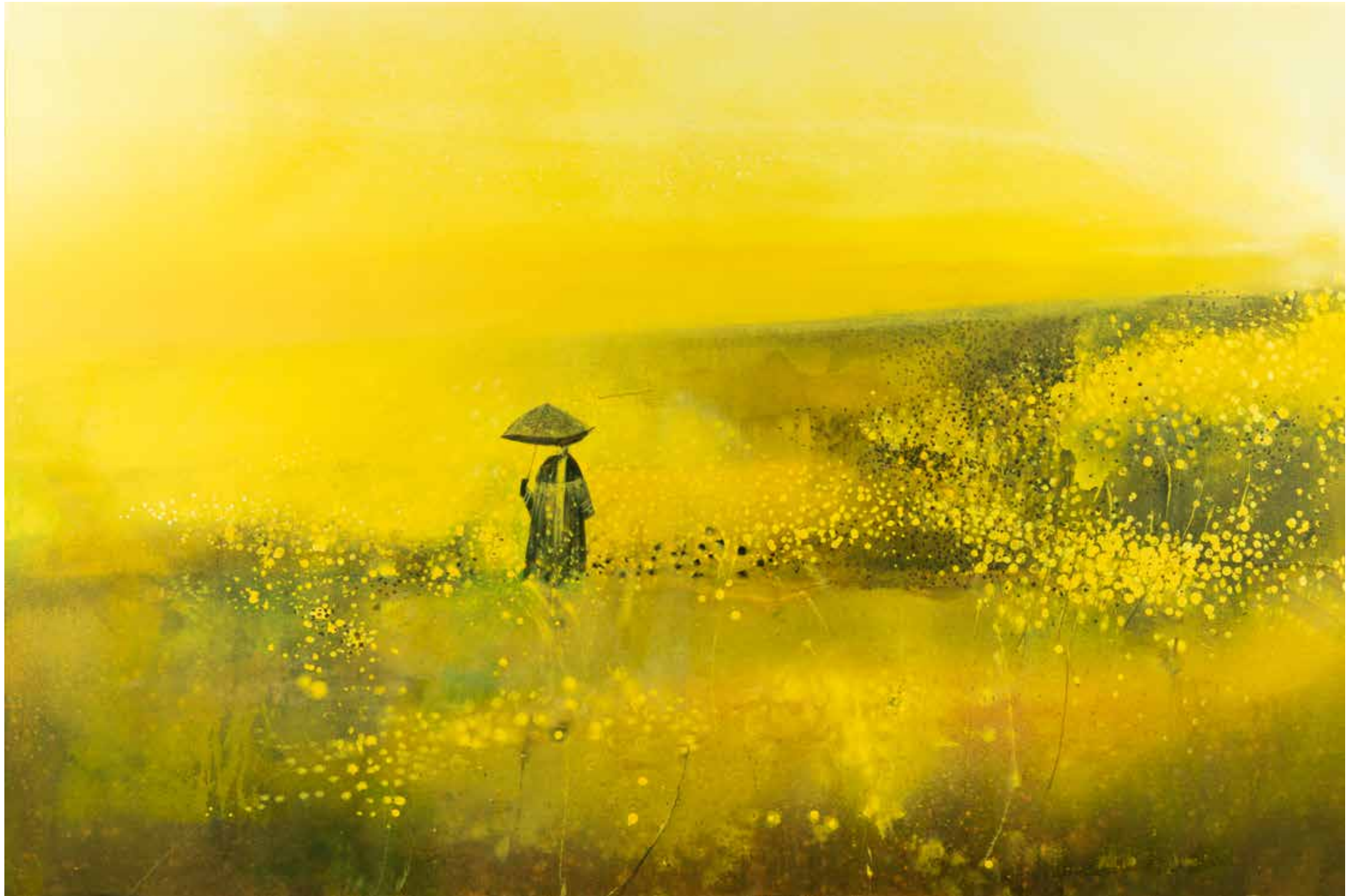
Taking a Trip Somewhere acrylic on canvas 106 × 156 cm