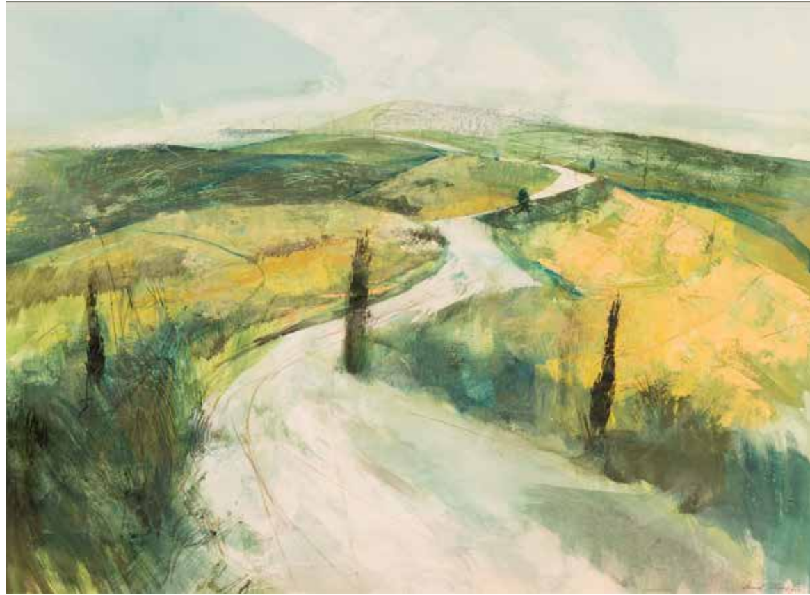
Road to Radi watercolour and gesso on paper 81 x 102 cm