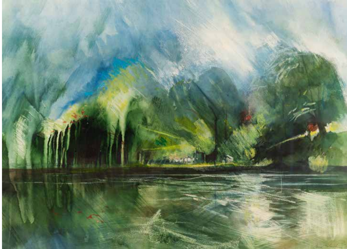
River Wye at Hay watercolour and pastel 80 x 70 cm