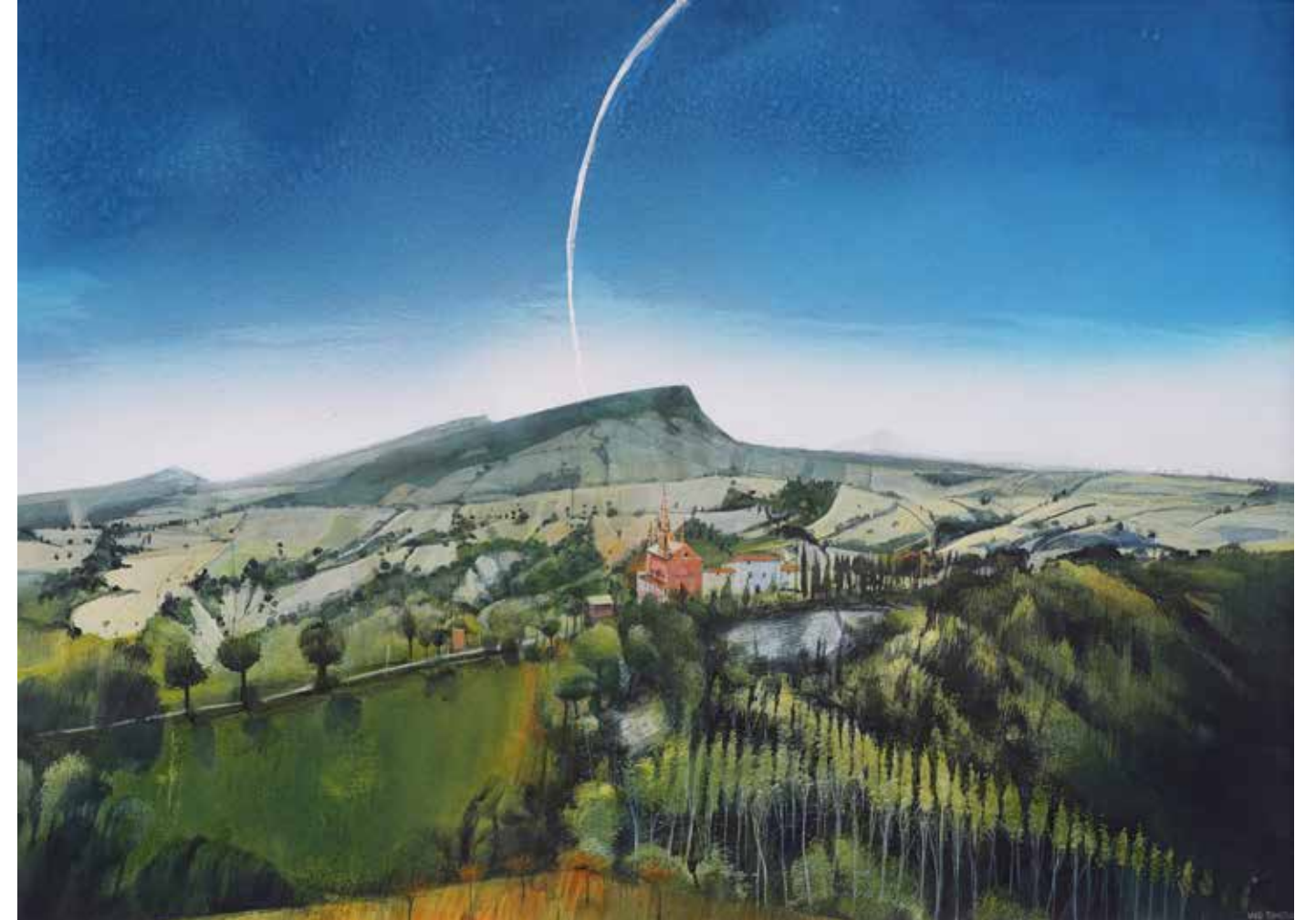
Pink Church, Le Marche oil on canvas 75 x 97 cm