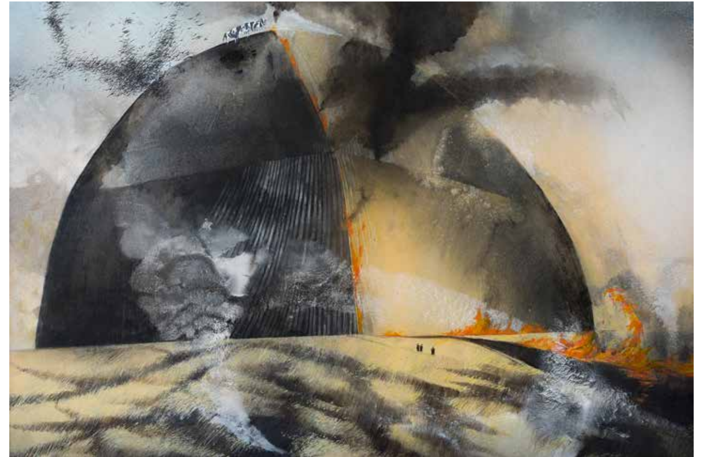
Cows on a Burning Hill watercolour 91 x 114 cm