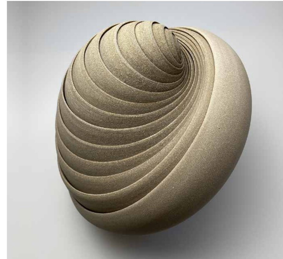
RIGHT Increase Outside 29 cm high