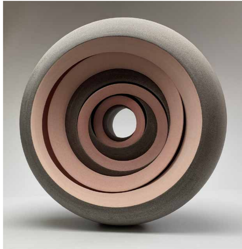
Revolve 46 cm high