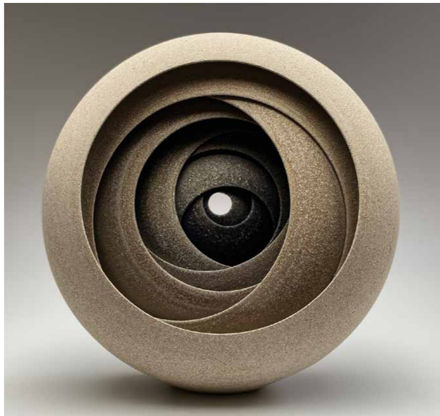
Fold 29 cm high