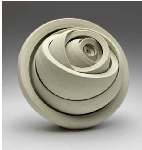
Twist Outside 19 cm high