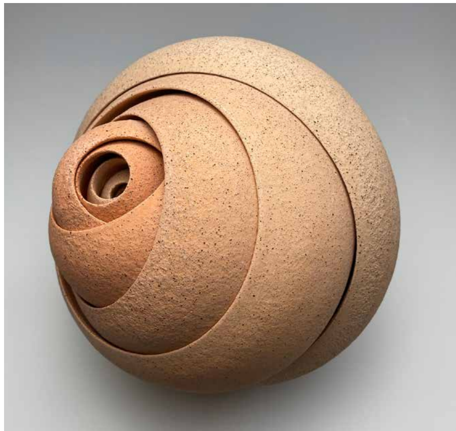
Bud 25 cm high