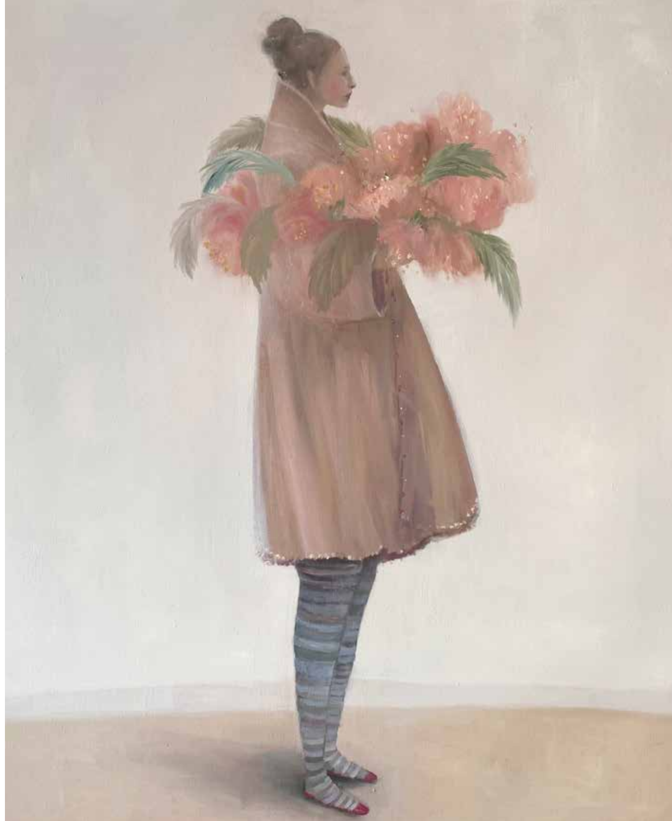
Possible oil on canvas 120 × 100 cm