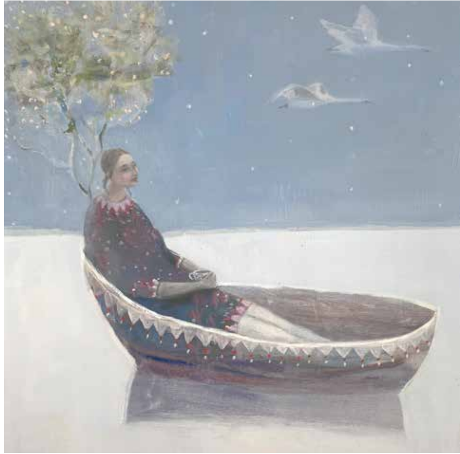
All that surrounds oil on canvas 40 x 40 cm