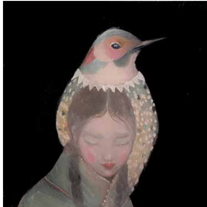
Trust oil on canvas 20 x 20 cm

First published in 2022 by Campden Gallery Ltd, High Street, Chipping Campden, Gloucestershire GL55 6AG www.campdengallery.co.uk