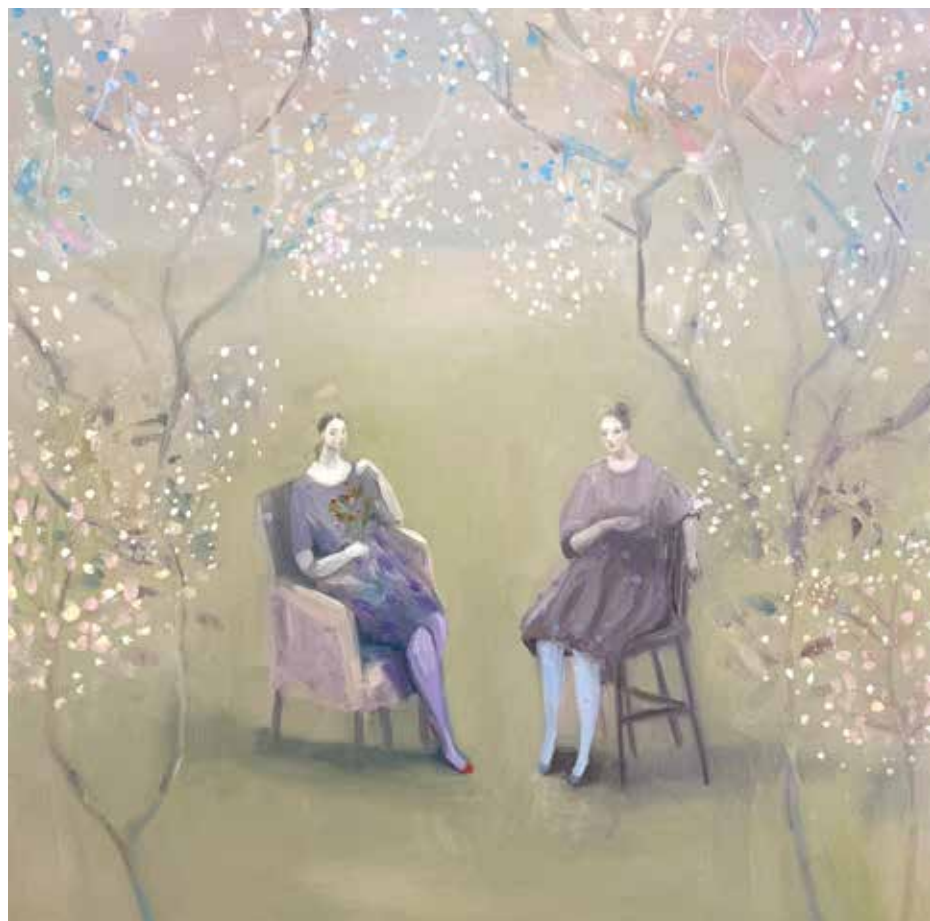
Garden oil on canvas 40 × 40 cm