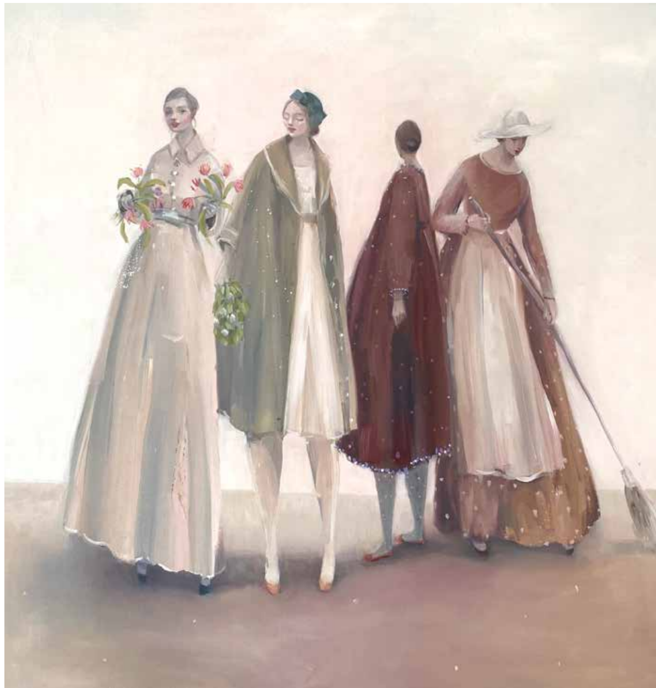
Finding your own way oil on canvas 100 x 100 cm