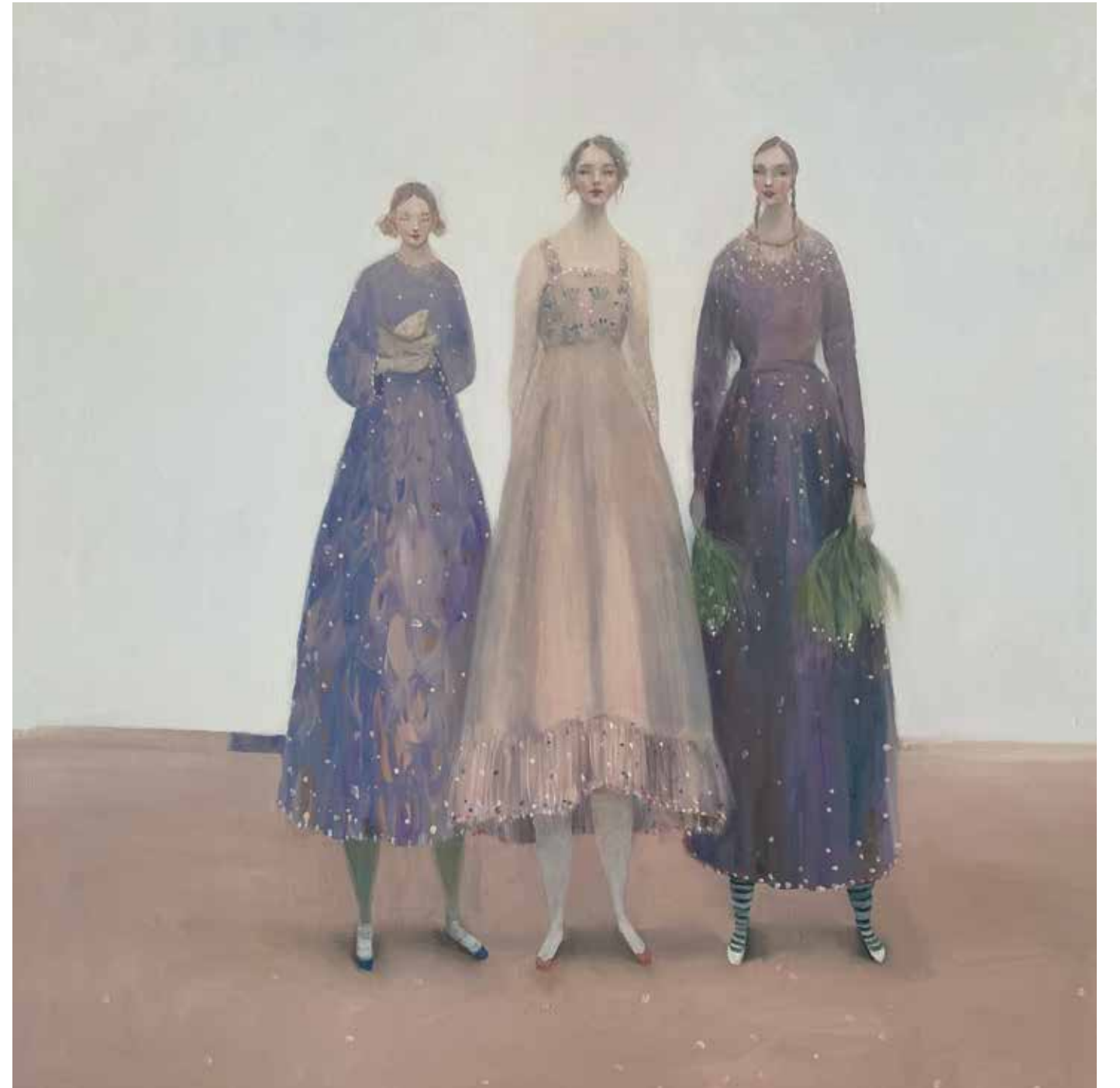
Side by side oil on canvas 100 x 100 cm