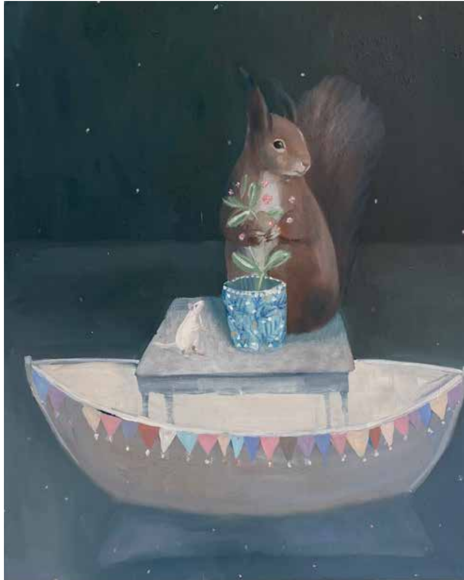
Journey with you oil on canvas 60 x 50 cm