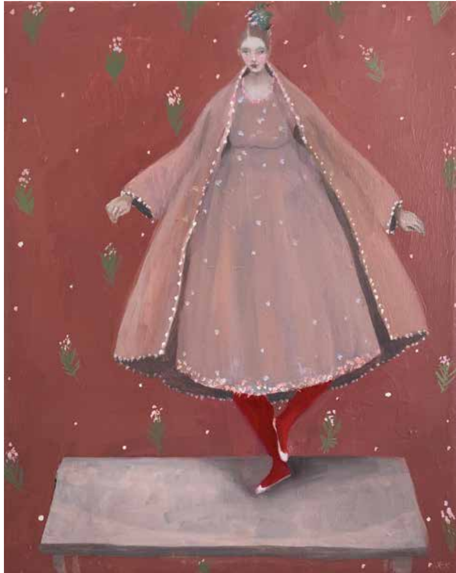
Unruffle oil on canvas 40 x 30 cm