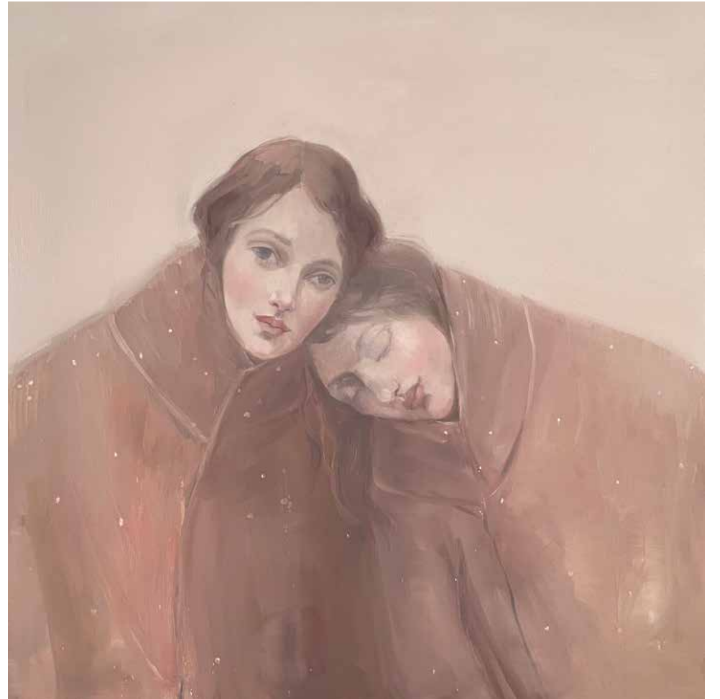
Fellow human oil on canvas 100 x 100 cm