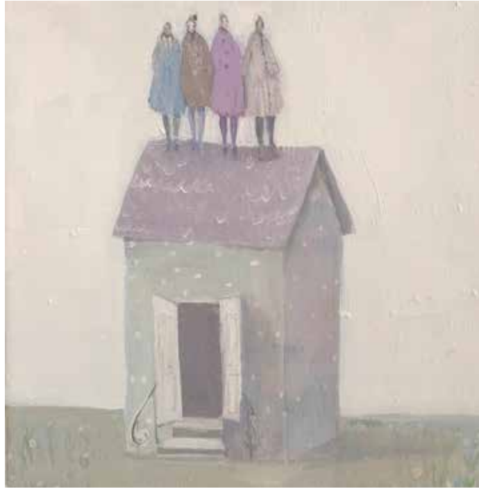
Few words oil on canvas 25 x 25 cm