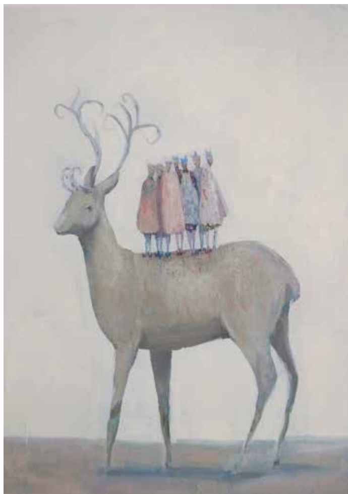
Remember oil on canvas 40 x 30 cm