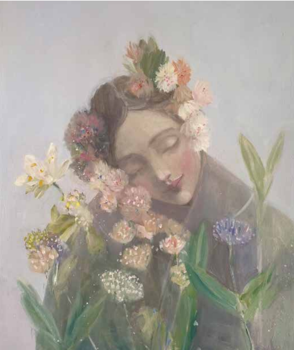
Nearby peace oil on canvas 60 x 50 cm