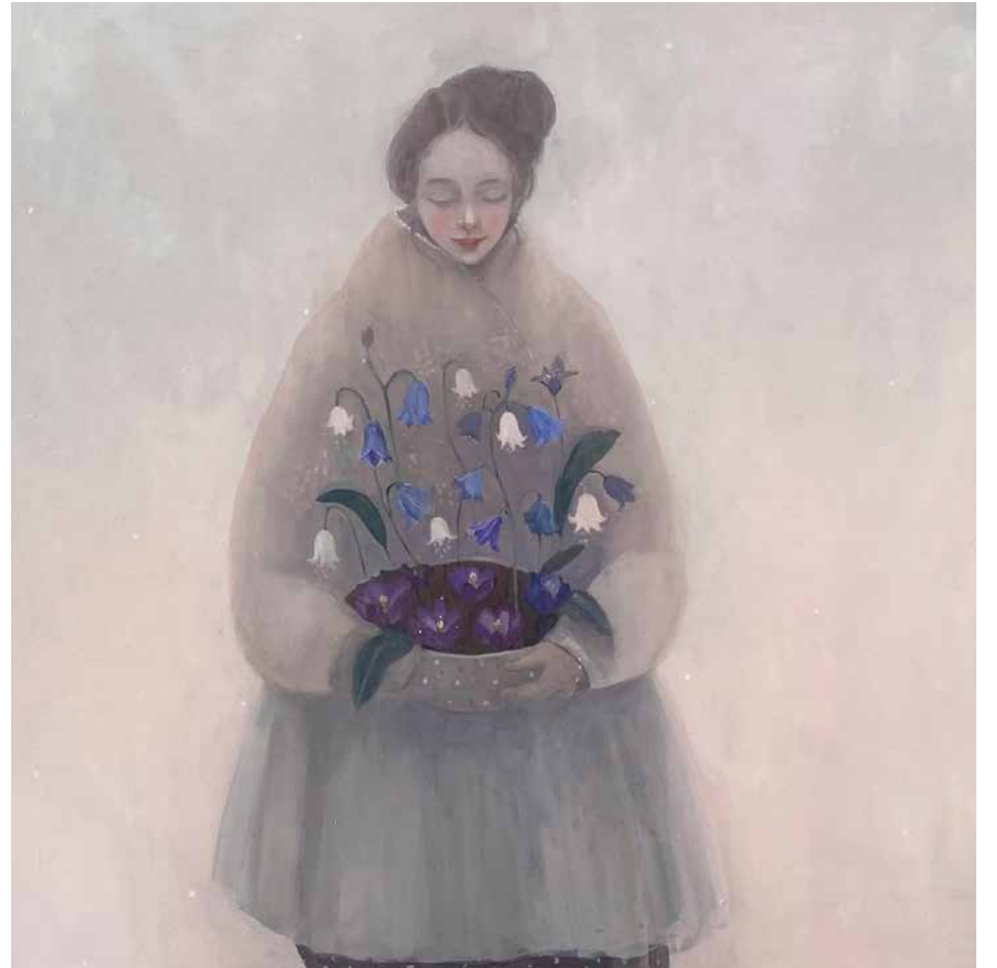
Simplicity oil on canvas 100 x 100 cm