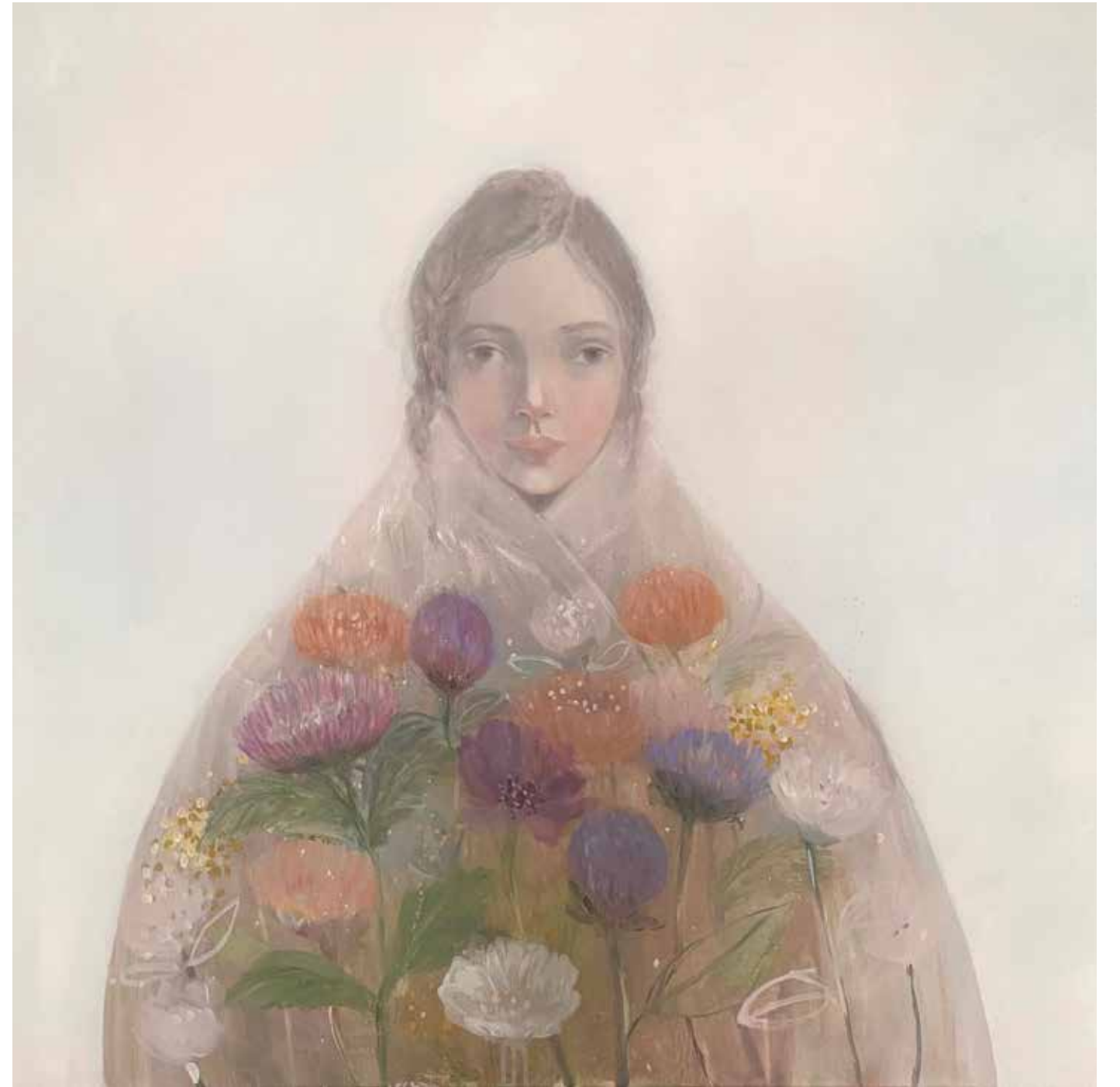
Meadow dreams oil on canvas 100 x 100 cm