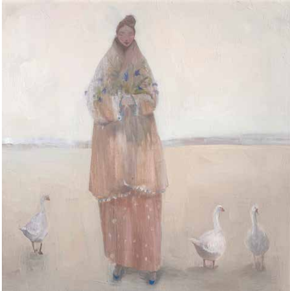
Gentle oil on canvas 40 × 40 cm