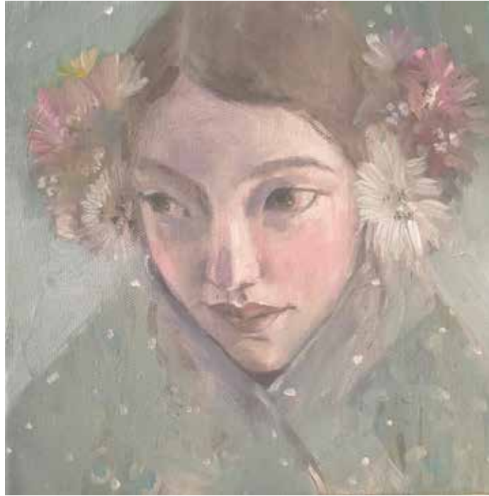
Open gently oil on canvas 20 x 20 cm