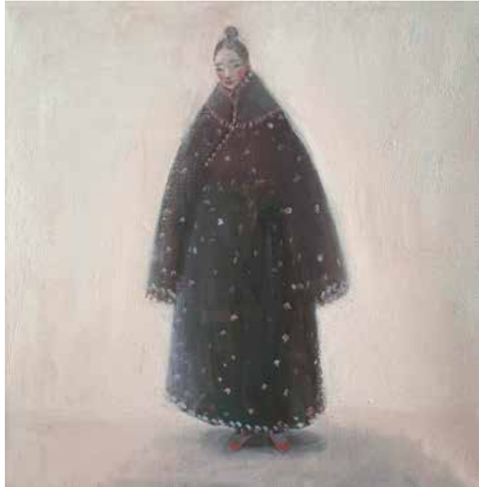
Little wanderer oil on canvas 20 x 20 cm