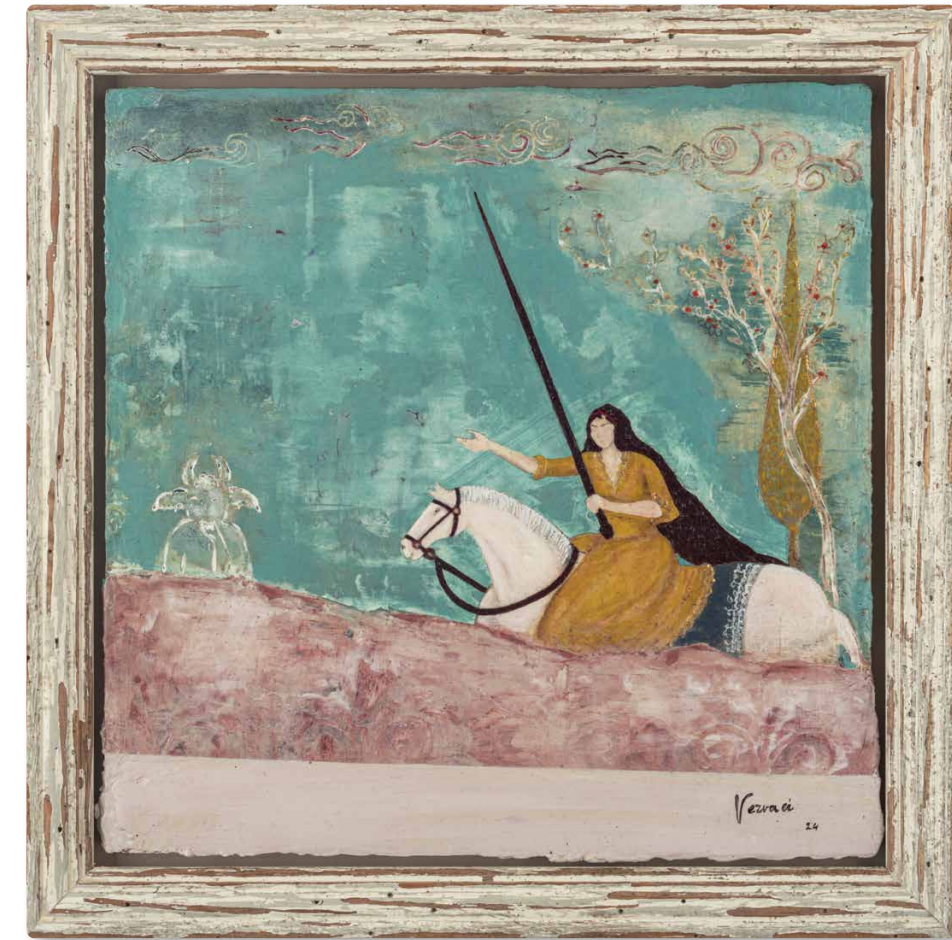
The lonely forest seek acrylic and mixed media on board 37 x 37 cm