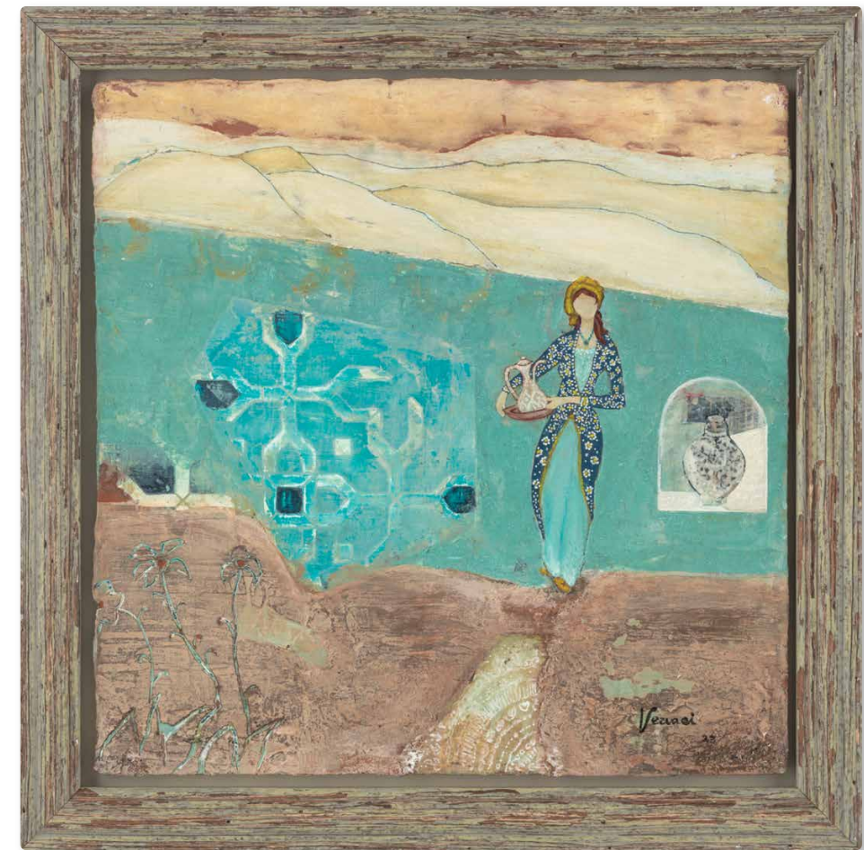
Turquoise path acrylic and mixed media on board 37 x 37 cm