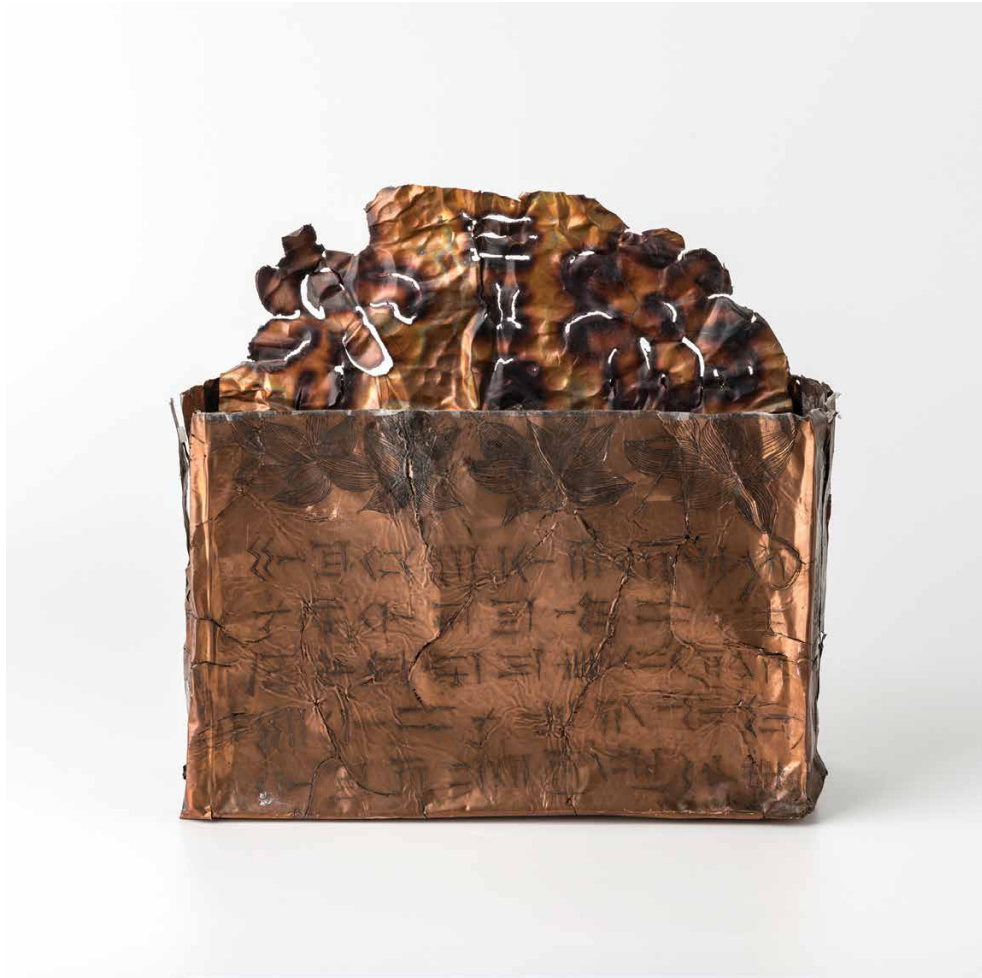
Artist Book etched copper 15 cm high