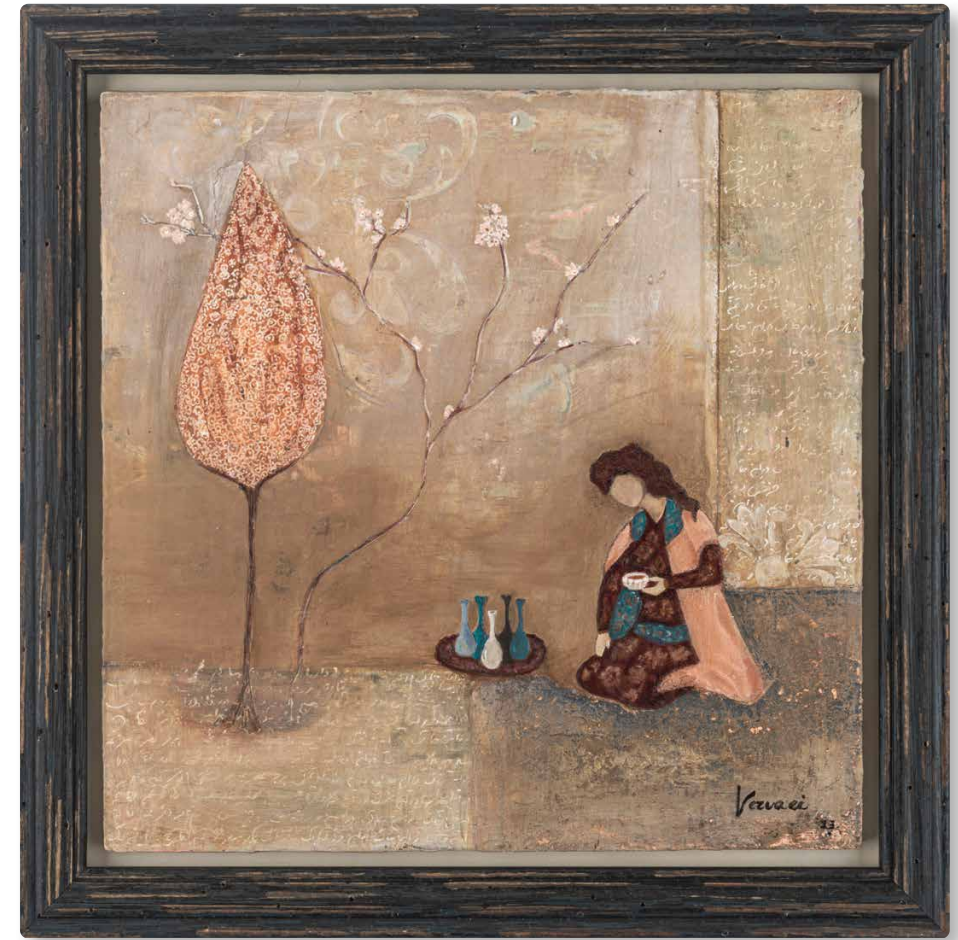
Pink cypress acrylic and mixed media on board 37 x 37 cm