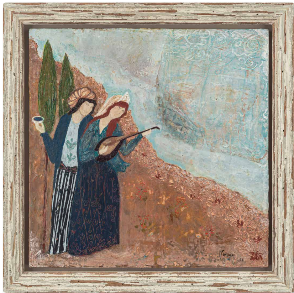
The siren wife acrylic and mixed media on board 37 x 37 cm