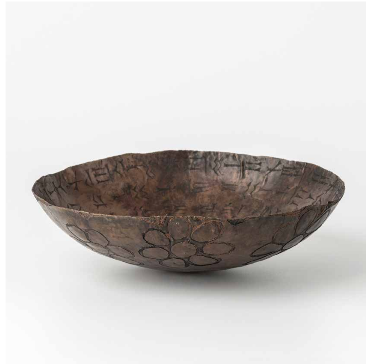
Untitled etched copper 19 cm wide