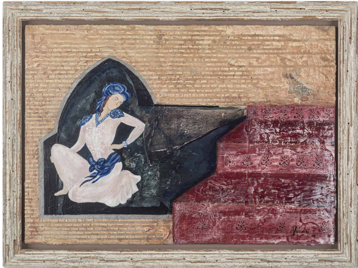
Tied to the past with dream acrylic and mixed media on board 39 x 51 cm