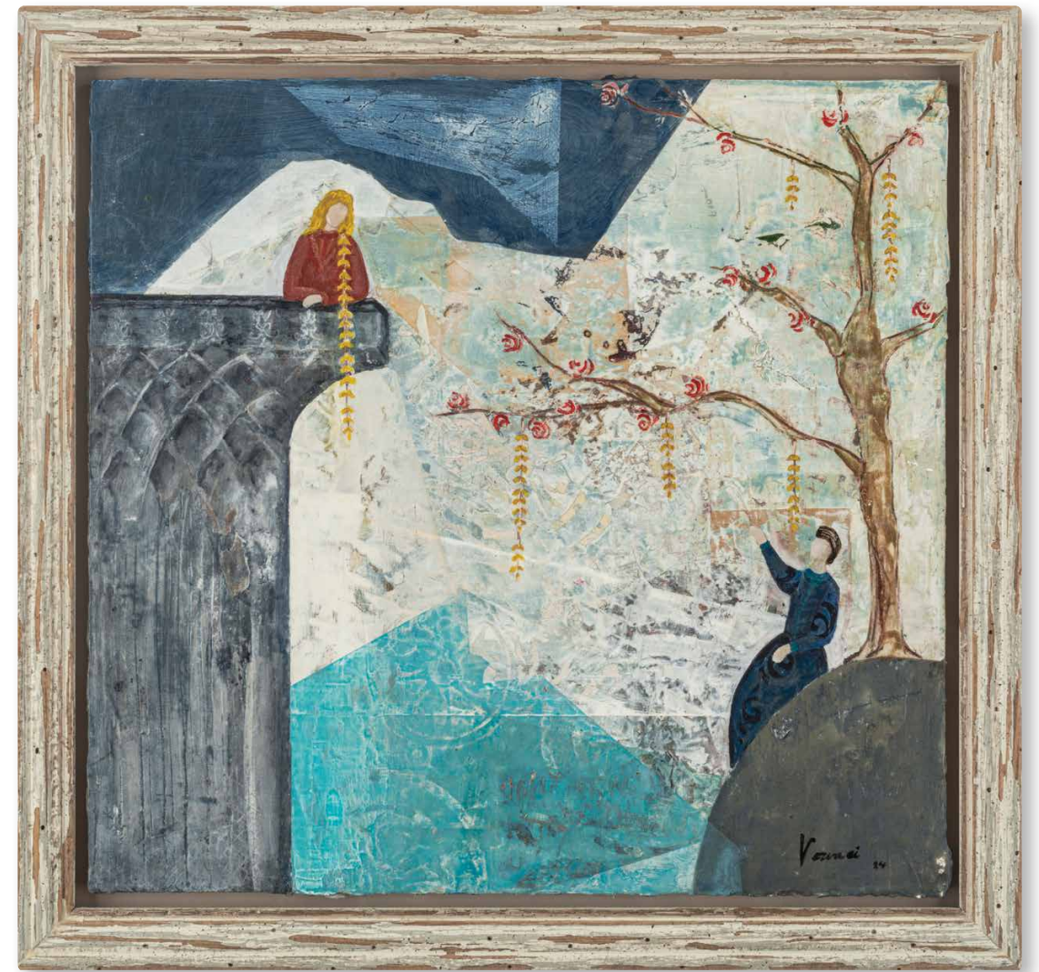
I will never let you use my hair again acrylic and mixed media on board 45 x 47 cm