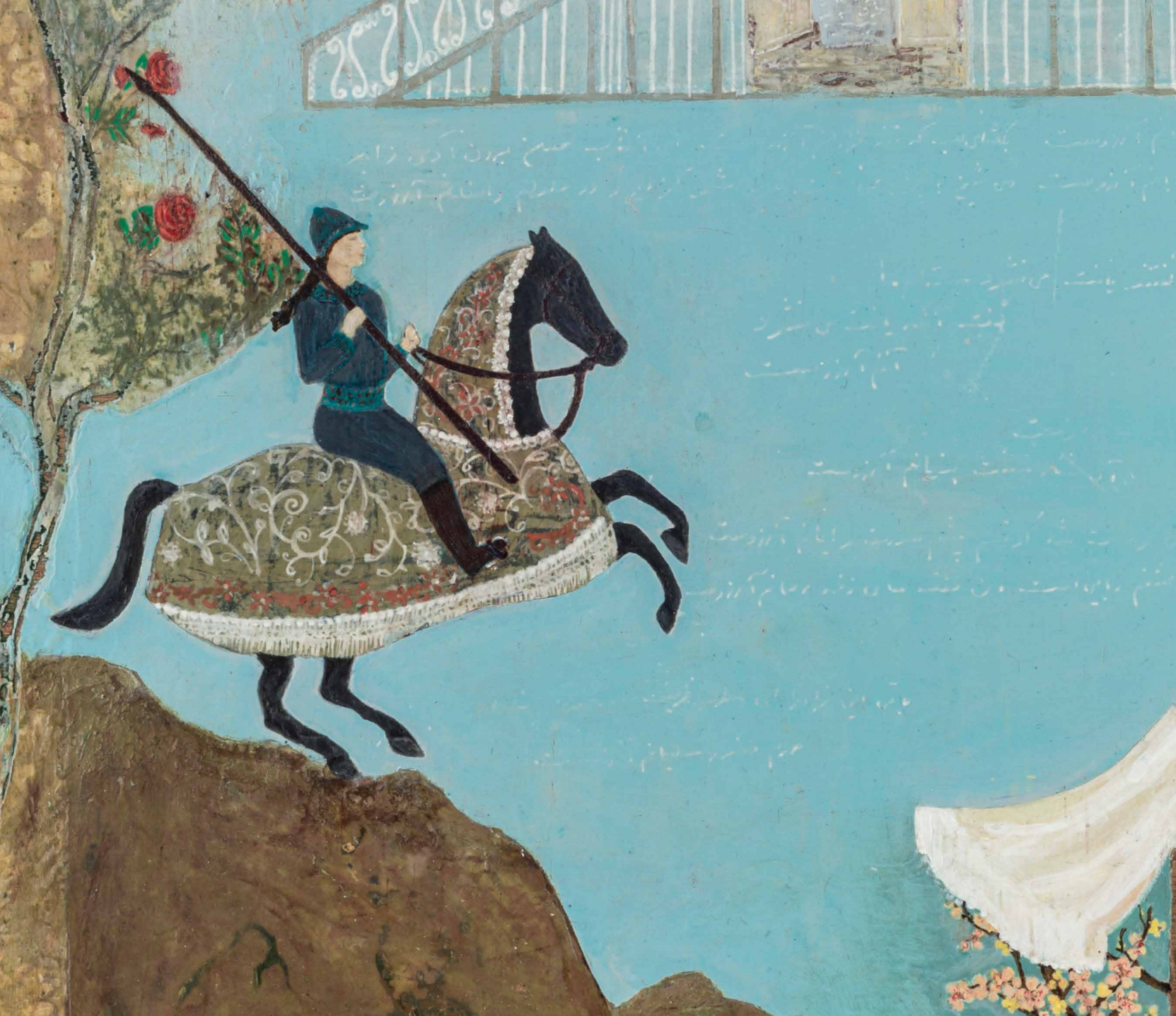
Under the pale blue moon acrylic and mixed media on board 70 x 52 cm