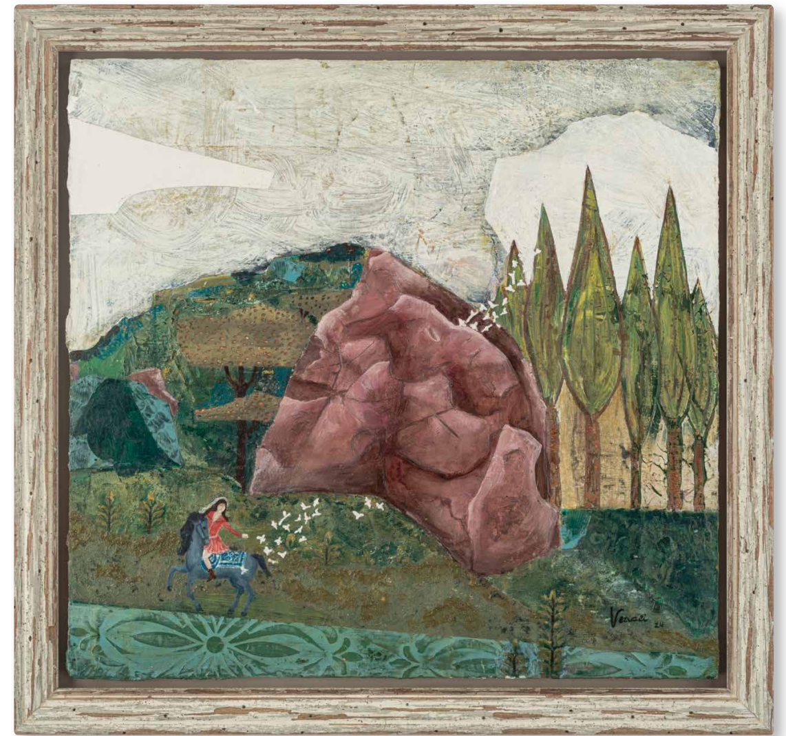
Enchanted forest acrylic and mixed media on board 45 x 47 cm