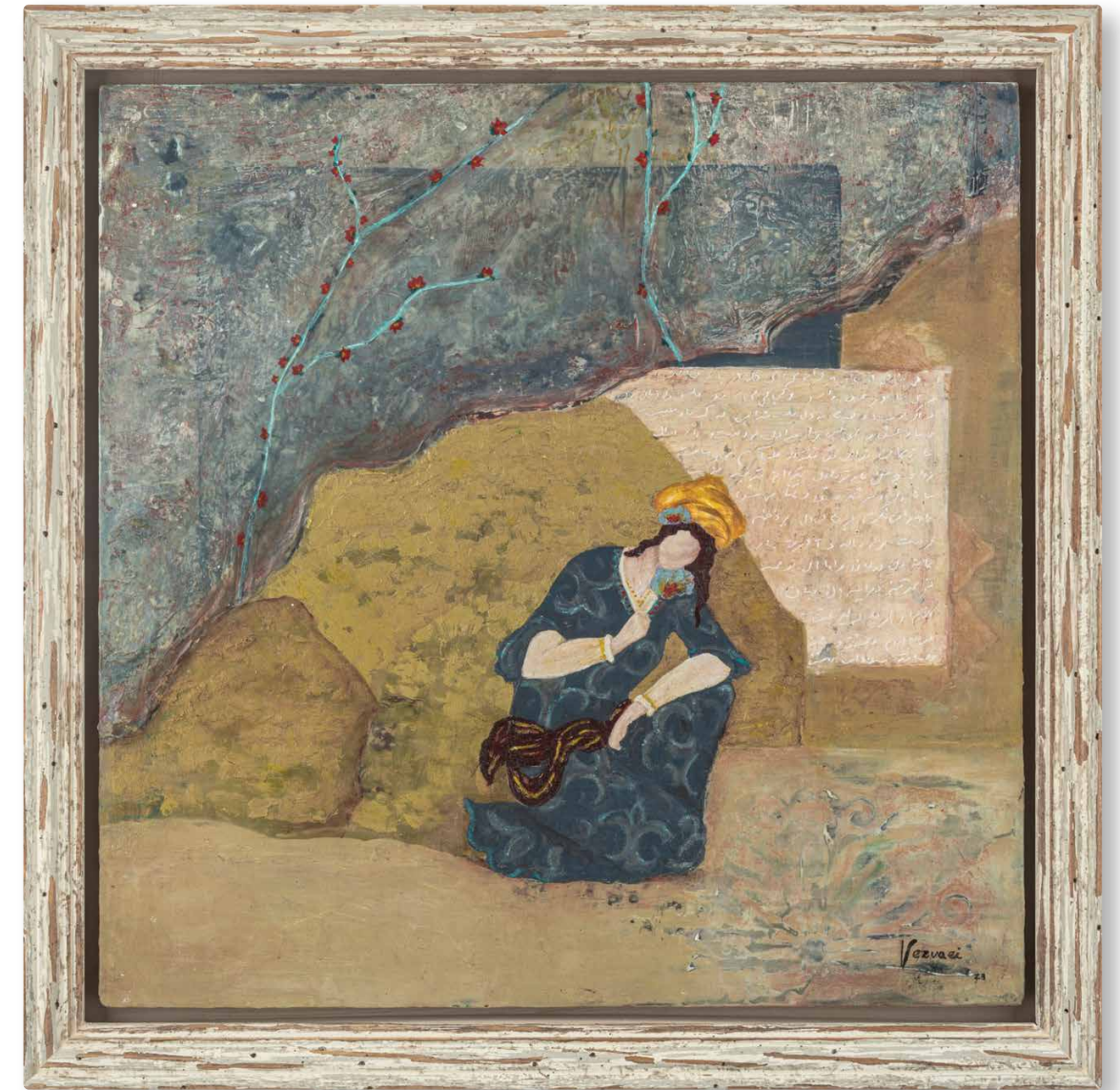
The Sunlight in the Garden acrylic and mixed media on board 47 × 47 cm