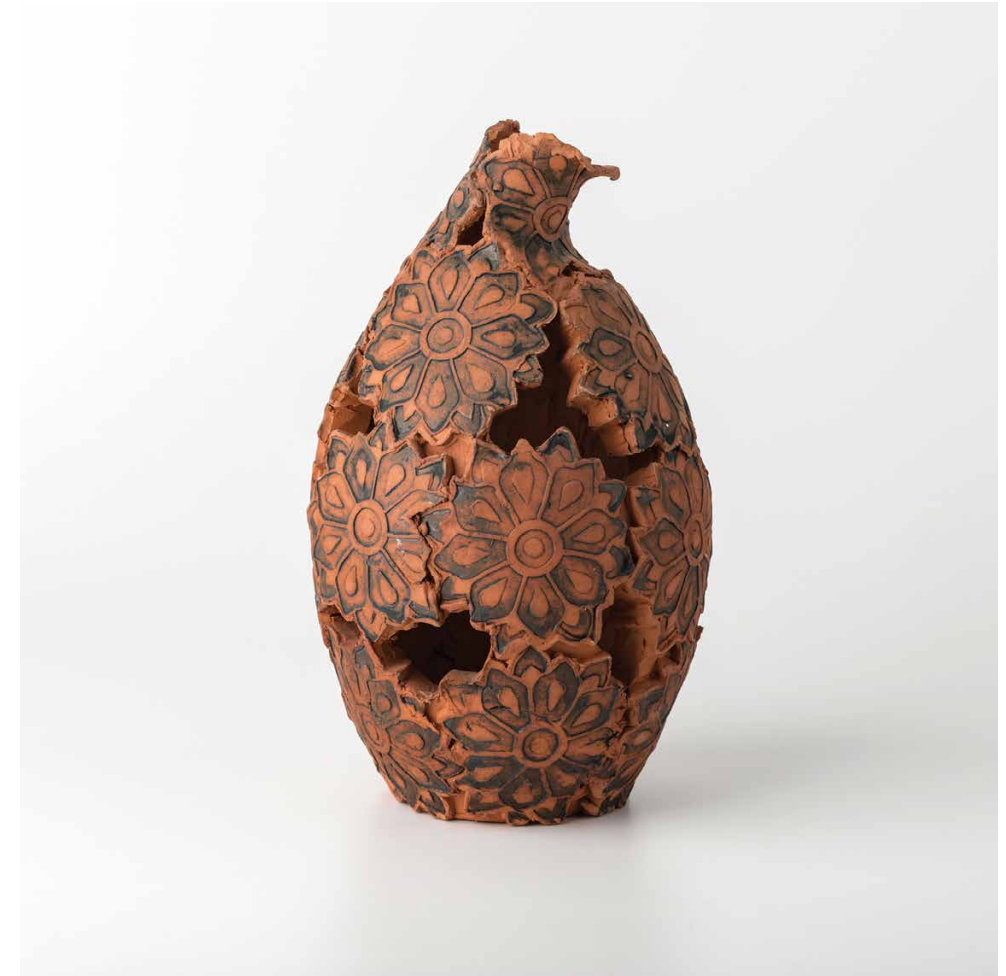
Lost and found ceramic 26 cm high