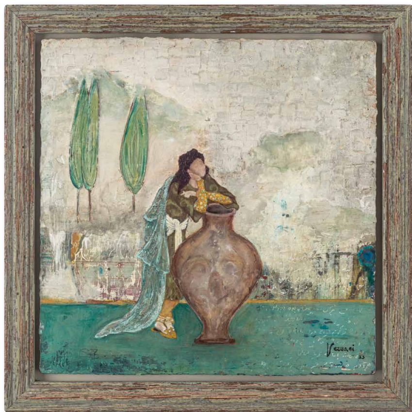
Will I end where I began? acrylic and mixed media on board 37 x 37 cm