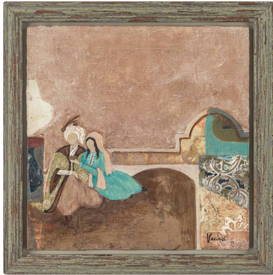
I will tell you the secret acrylic and mixed media on board 37 x 37 cm