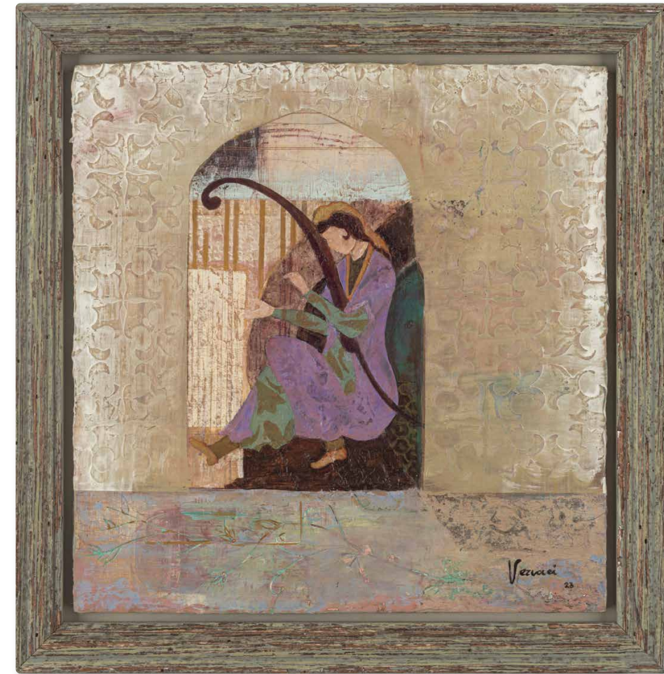
Silent harp acrylic and mixed media on board 37 x 37 cm