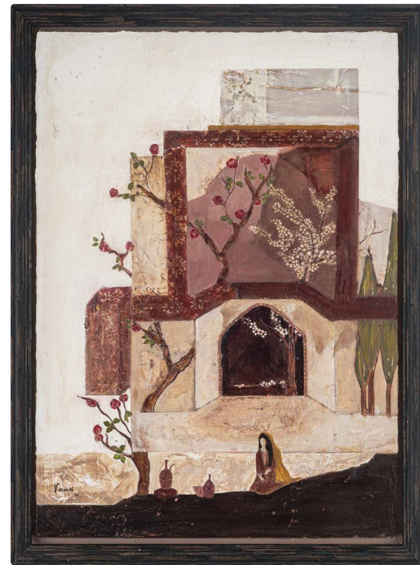
Warming her pearls acrylic and mixed media on board 70 x 52 cm