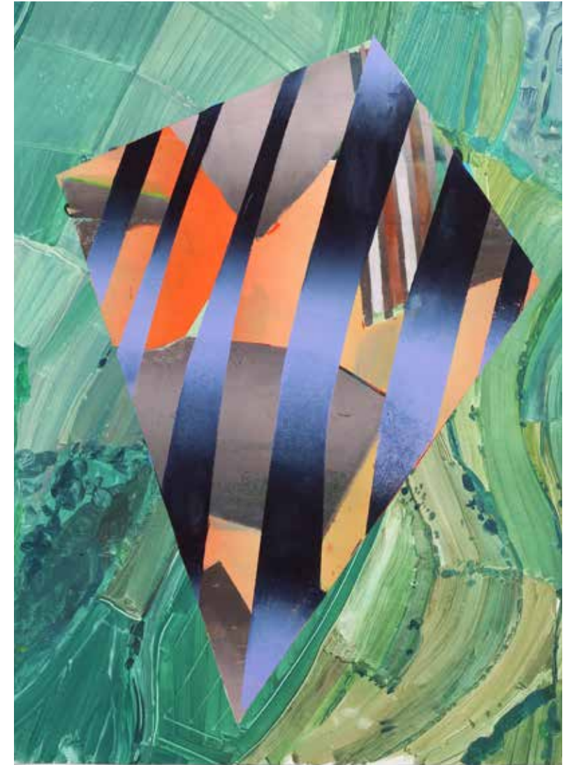
Kite II oil on paper 65 x 48 cm