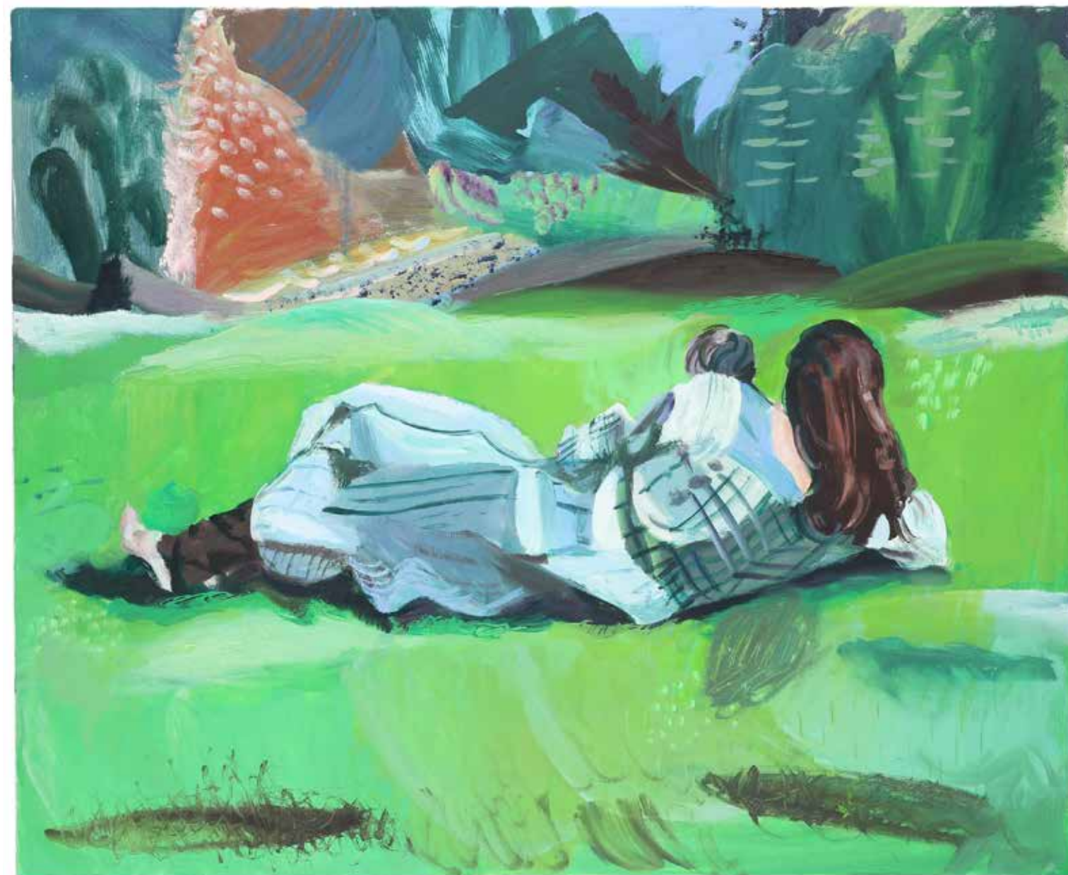
Mother and Child oil on canvas 90 x 110 cm