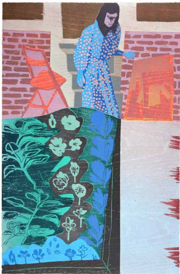
Flower bed reduction woodcut, ev.10 60 x 40 cm