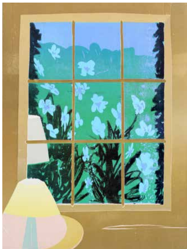
Cosmos reduction woodcut, ed.10 30 x 35 cm