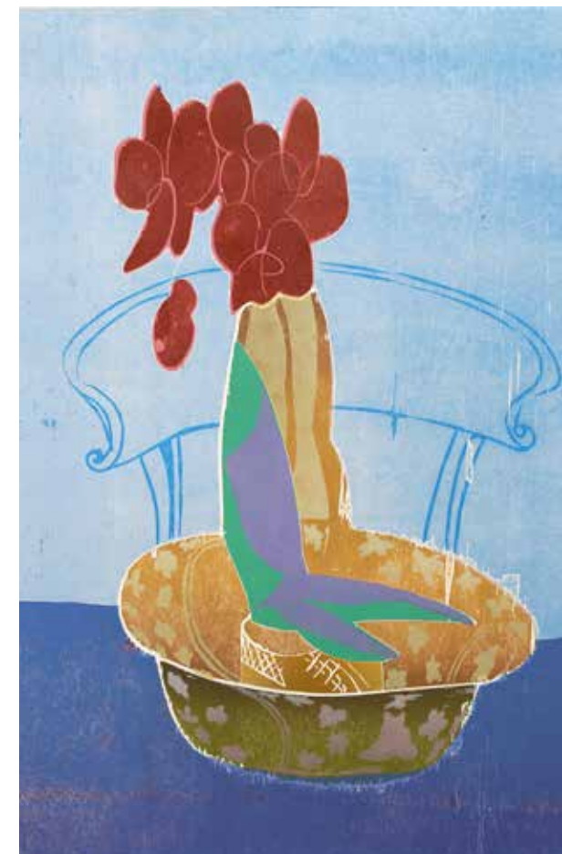
Orchid reduction woodcut ed.10 60 x 40 cm