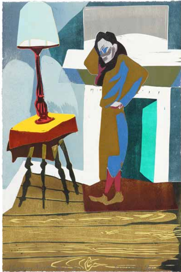
Tuesday Night reduction woodcut, ev ed.10 46 x 31 cm