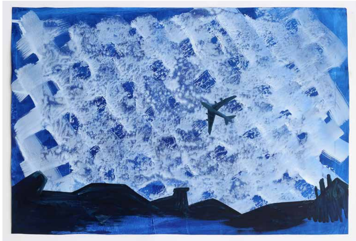
Cloud oil on paper 65 x 98 cm