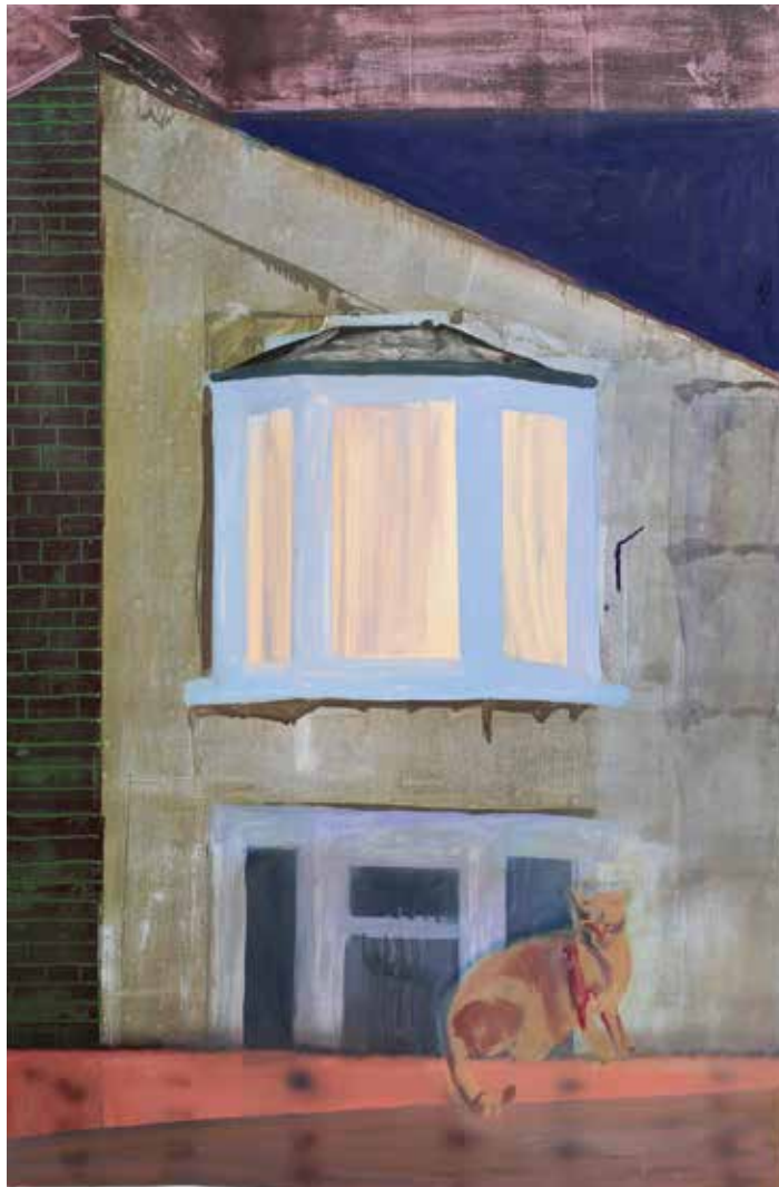
Window oil on paper 118 x 78 cm