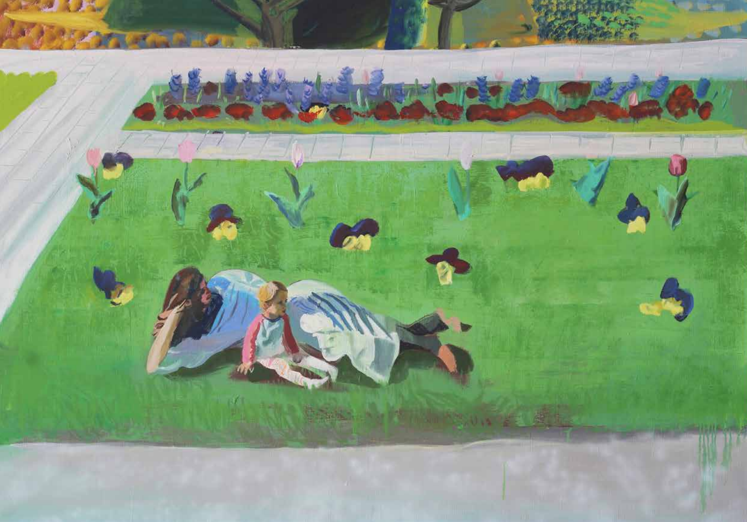
Mother and Child, Park oil on canvas 100 x 140 cm