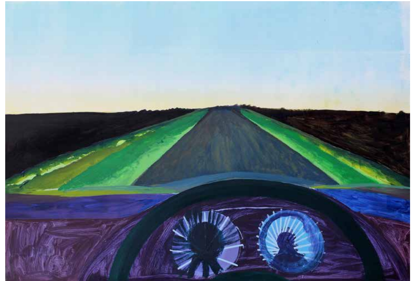
Road oil on paper 71 x 100 cm