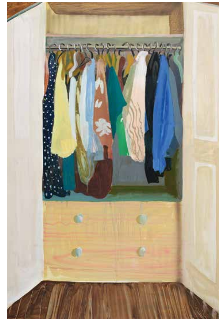
White Wardrobe oil on paper 97 x 68 cm