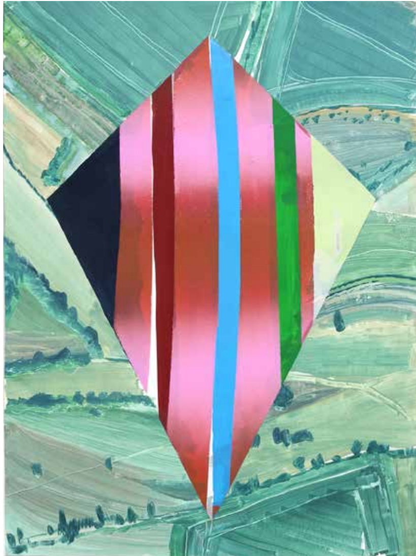
Kite I oil on paper 65 x 48 cm